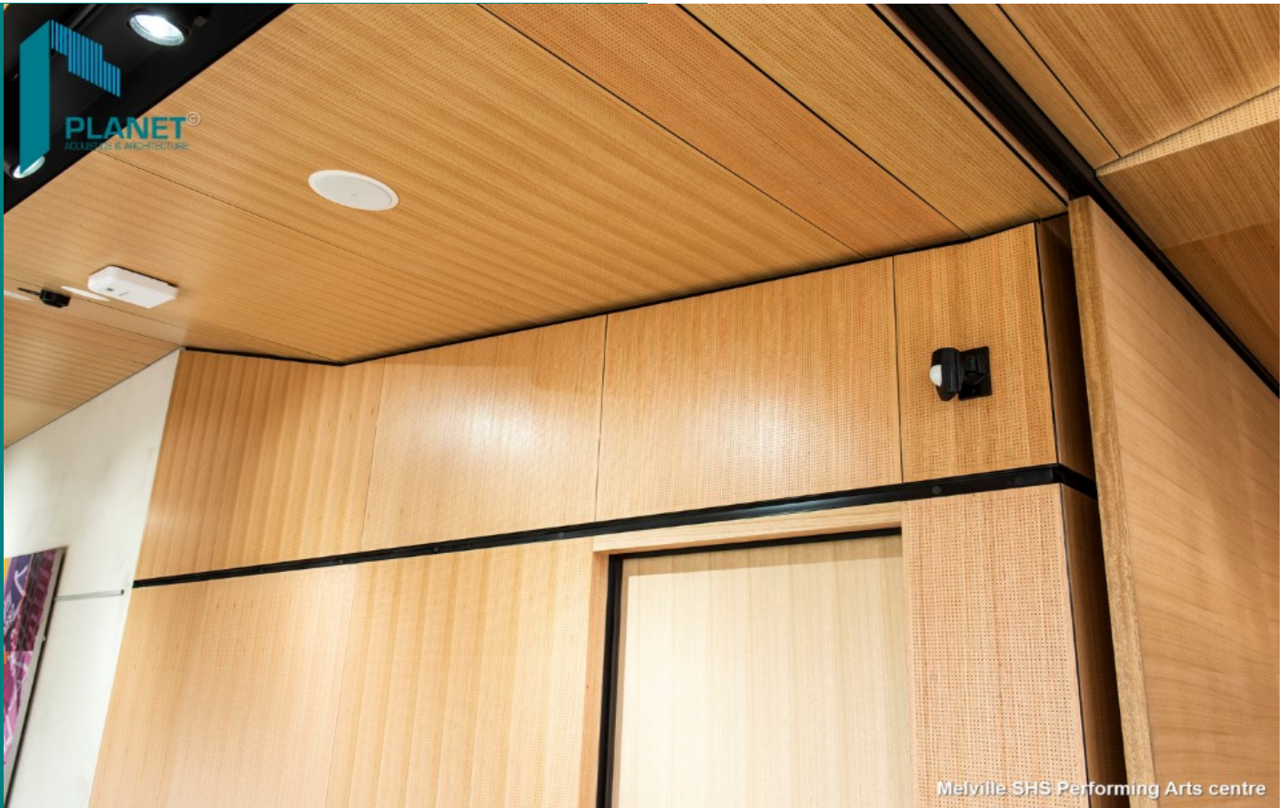
Melville SHS Performing Arts centre